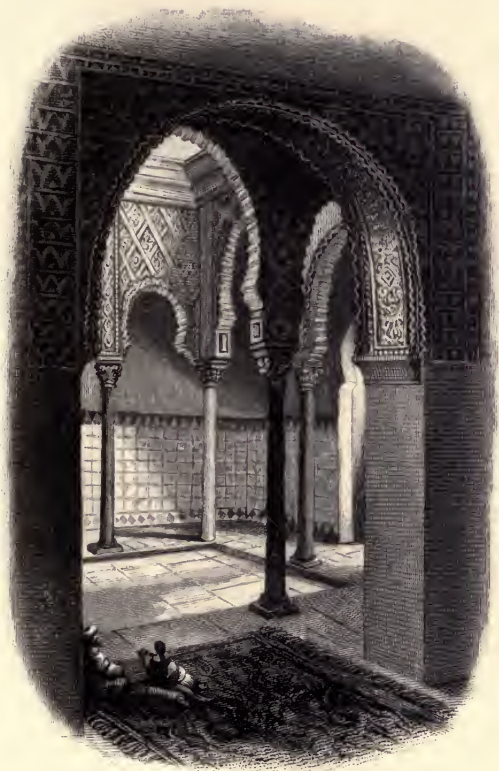
The Court of Dolls. Alcazar. Seville.